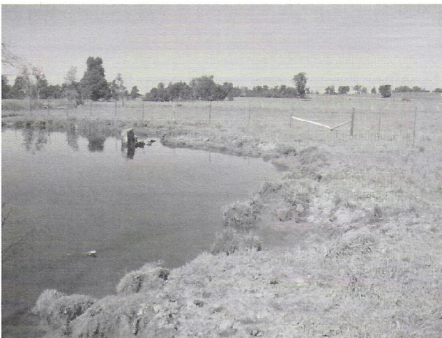
New page-wire fencing protecting eroded creek bank on Elbe Creek

The projects are well-supported by the community. Project partners include the landowners, CLEA, Cataraqui Region Conservation Authority, Ducks Unlimited, Eastern Ontario Model Forest, Frontenac Arch Biosphere Reserve, Human Resources and Skills Development Canada, Leeds Federation of Agriculture, Leeds Soil and Crop Improvement Association, Ontario Ministry of Natural Resources (CWIP), Trees Ontario, and the Wetland Habitat Fund.