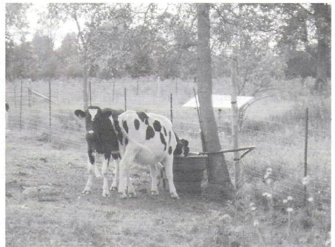
Cattle drinking from solar watering system on Foster's Creek