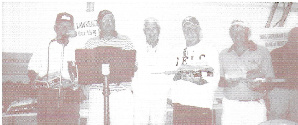
2004 Team Champion - record score of 59; 13 below par