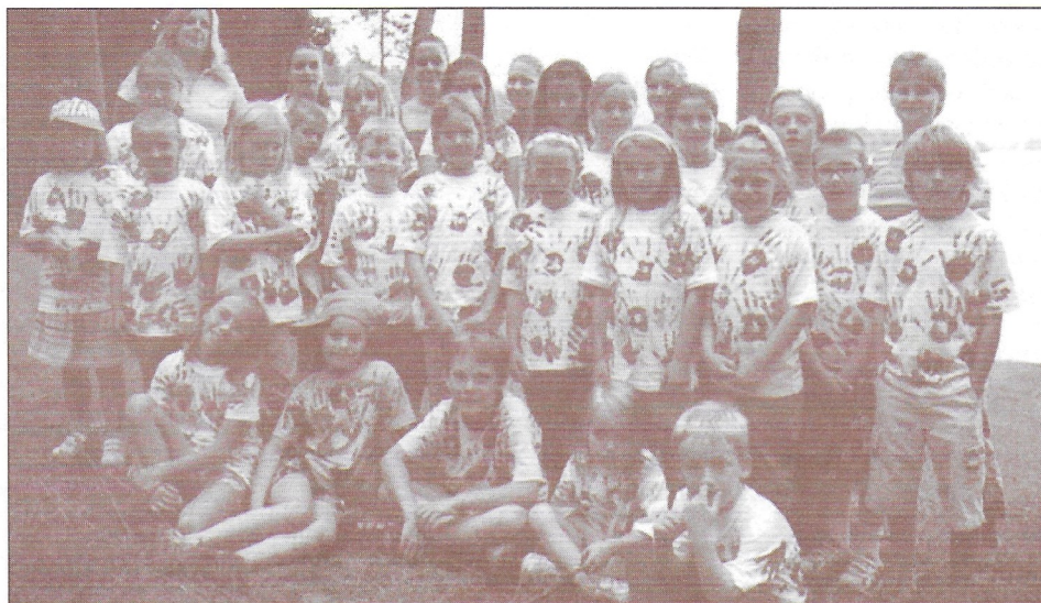
Charleston Lake Association Youth Camp participants pose for a photo, wearing autographed hand painted Friendship T-shirts, at Charleston Lake Sand Bay Park Friday, July 8, 2005.