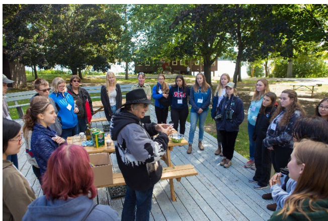
First Nations Medicine Workshop

Run for youth by youth, the 2023 Youth Summit for Mother Earth will offer a unique cross-cultural event with opportunities for young Indigenous and non-Indigenous leaders to connect, participate in educational workshops, and take part in a weekend of outdoor fun and learning.