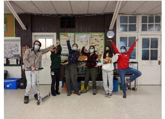
Environmental Activism and the Arts Workshop

Over the past 14 Summits, we have engaged 852 youth from 237 communities across Ontario, representing nations across North America/Turtle Island and cultures around the world.