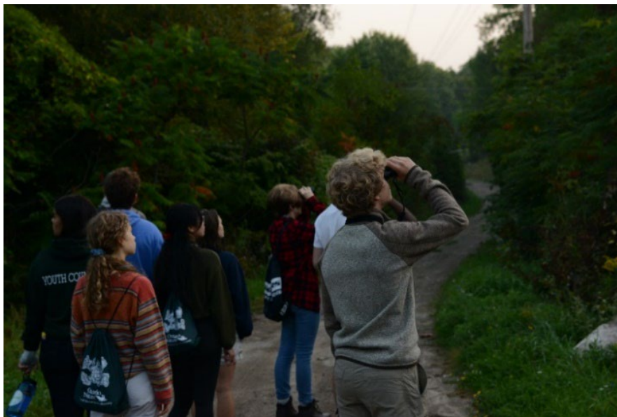
Early morning birding hike

In recognition of your sponsorship, your group's name will be included in program materials, any signage at the Summit, Ontario Nature's Annual Report and the Youth Summit webpage . A thank you report will be sent to all sponsor groups.